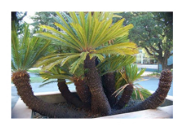
King Sago at UC Berkeley Campus