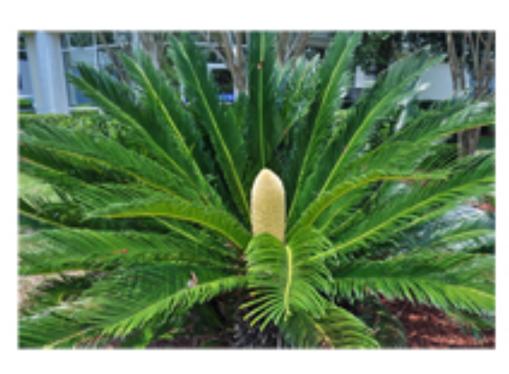
Sago Palm - male plant

In Loving Memory of CH Kaliber's Unforgettable CD ~ lost to Sago Palm toxicity ~