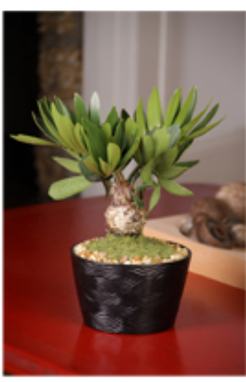
Ornamental Cardboard Palm