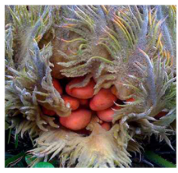
Sago Palm - female plant

Outside of the U.S. they are found in the New World tropics, Southern Africa, South and East Asia, Australia and the South Pacific. In Australia, loss of cattle afflicted with the "zamia staggers" led to government cycad-eradication campaigns. This family of palm plants are not only found in outdoor landscapes, but as ornamental houseplants as well.