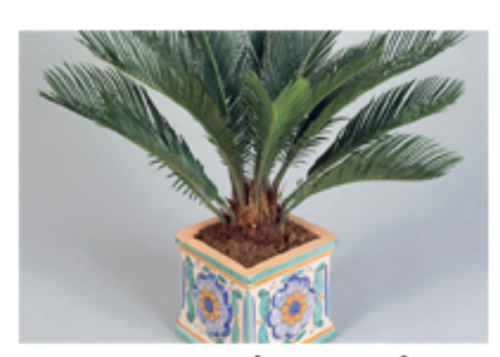
Ornamental Sago Palm

Due to the toxic components in these palms, it is important to wash your hands thoroughly after handling any part of the plant, as well as to wash your clothing and any gardening tools that came into contact with the plants.